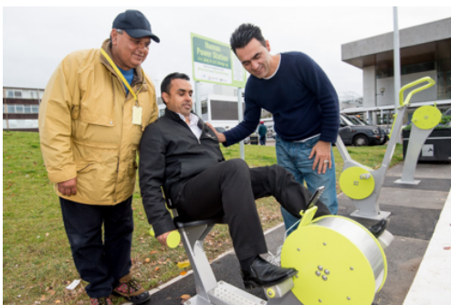
Coventry taxi drivers were enthusiastic about new human power station by their rank at Coventry Railway Station.

Mayor Andy Street teamed up with former Olympian David Moorcroft to launch the WMCA physical activity strategy West Midlands On The Move at Coventry railway station last month.